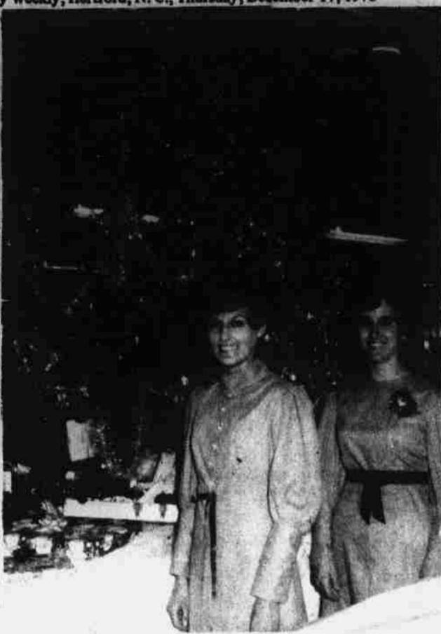
EMPLOYEES OF DON JUAN ENJOY CHRISTMAS PARTY.