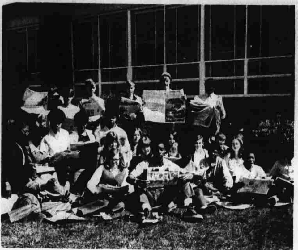
Shown in the above photo are students of the eighth grade of Perquimans High School enjoying a Read-Out.