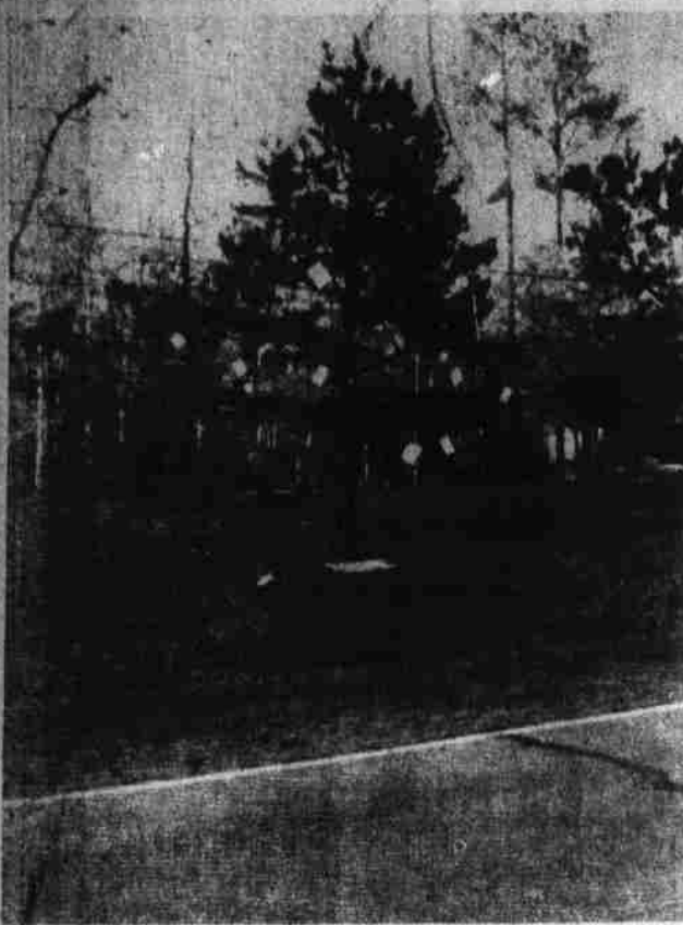
The above picture is of the Seymour Chappell's Christmas tree. The tree is loaded with presents and underneath the tree is a sign reading Merry Christmas Neighbors.