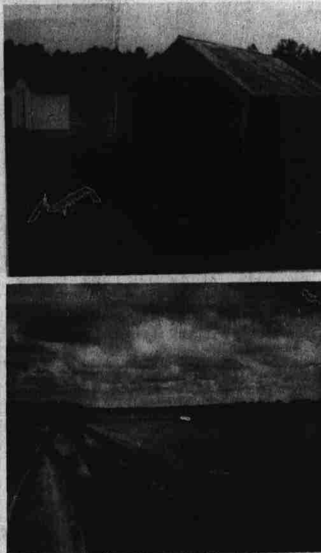
The above pictures show flooding around buildings and flooding of cropland in Bear Swamp. The farmers in Bear Swamp are hoping to get present channels enlarged and some new laterals constructed through Public Law 566 — the Small Watershed Program.

The Bloodmobile will visit here Wednesday, August 23. The unit will be at the Hertford Methodist Church from 12 noon till 6 p.m.