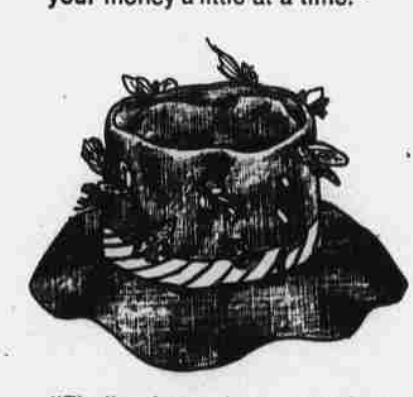
"Finding better insurance than Ford Dealer insurance is harder than tying flies in a wind storm."