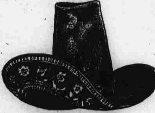
"When a Ford Dealer talks easy credit terms, he's talking everyone's language."