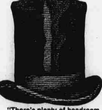
"There's plenty of headroom inside all the Ford cars and trucks . . . even with the little Pinto."