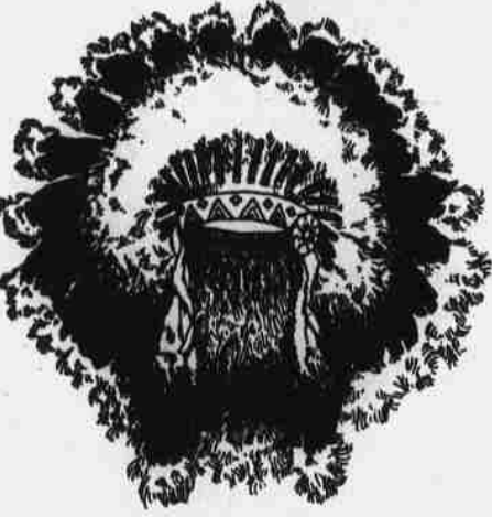
"When you trade in your old car for a new one, you won't get scalped in the process."

Why Ford customers tip their hats to Ford Dealers.