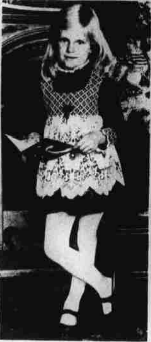
HOLIDAY GOODIES —For a very feminine holiday look, it's the apron dress. White tablecloth lace is posed over black and white pin-dotted cotton in this little girl charmer from Cinderella's holiday collection.

The two largest bond issues proposed during the year were defeated; a $20 million proposal in Durham and Durham County, and a $9.7 million request in Cabarrus County. Also defeated, by only nine votes, was a $4 million request in Cleveland County.