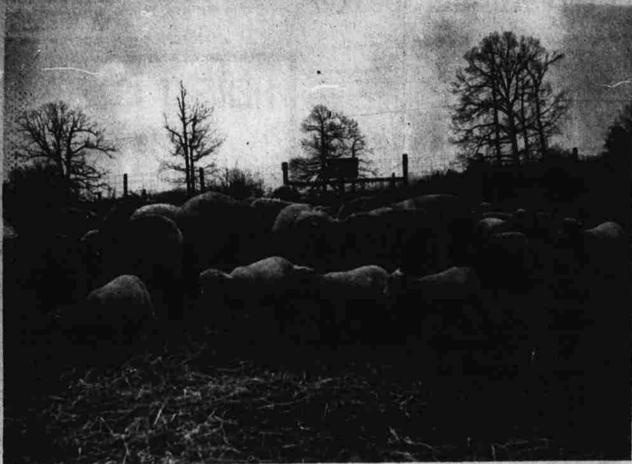
BAH, BAH, BAH — There aren't many of them left in North Carolina, but sheep are back in favor economically. The manager of this Orange County flock who raises sheep

and cattle, declares that the sale of lambs—plus a token amount of wool—is just as profitable as his beef operation.