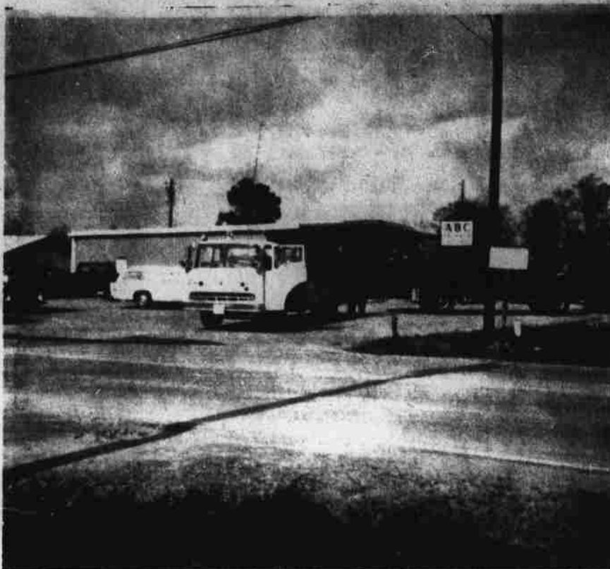
ABC STORE HAS BIG BUSINESS — Monday afternoon, the volunteer firemen in the county made a rush to the ABC package store on U.S. 17. It seems that faulty wiring caused slight smoke and where there is smoke there is usually fire. However, there was no damage to speak of at the local package store and business went on as usual.