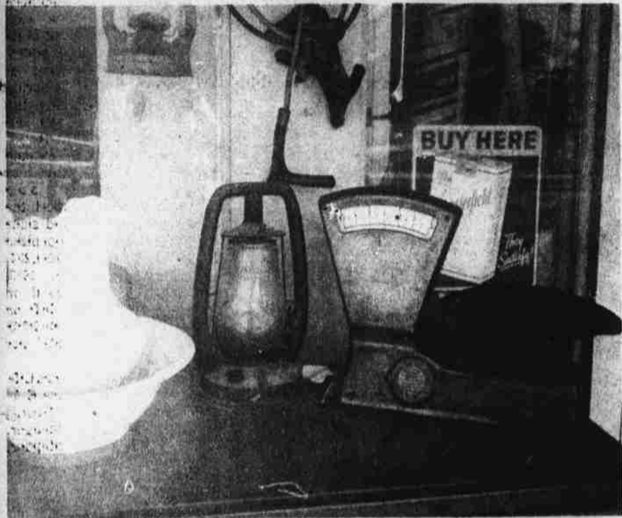
NECESSARY ITEMS — Way back then, the pitcher and bowl was the way a bath was taken in granny's house. Fresh water came from the well or pump and on cold mornings, a face wash was a chilling experience. To see at night, the reliable kerosene lamp was used. The lamp is used now when a power shortage comes our way. Remember going to the corner store to buy something by the pound? Mr. Storekeeper always used this handy scale to way all purchases.