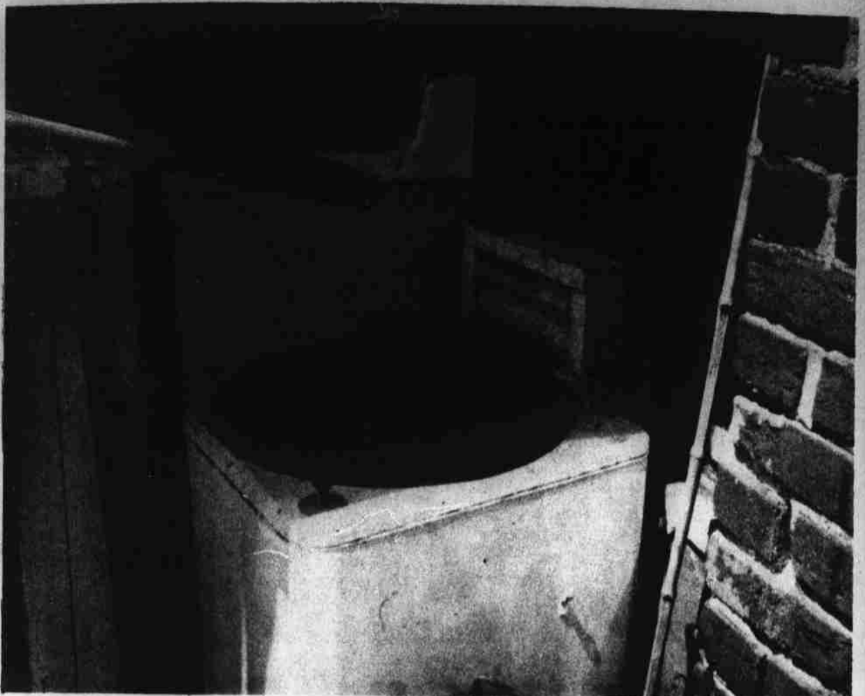
WASHDAY BLUES — Oh, the fun of it all, when a wringer type washer, washed the family clothes. Not so old, and in still many households, the wringer-

washer was at its peak some 30 years ago. Many a child got its hand and arm caught in the wringer.