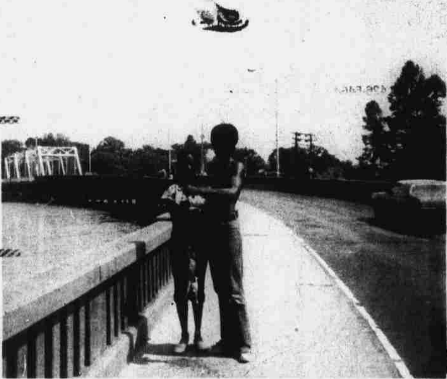
THE FISHIN' IS JUST FINE — The Perquimans River not only adds charm to Hertford, but it is also very useful as is shown here. Quite a nice catch.