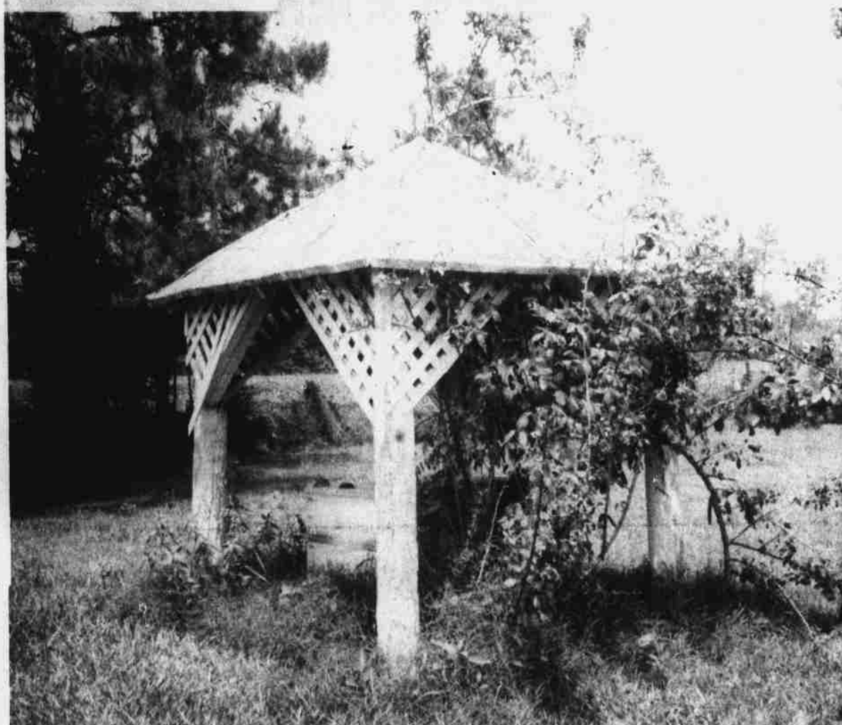
NICE TOUCH — A nice touch to any yard is this runner for roses spotted in the Bethel community. No one could think of the name for the gadget which catches the roses as they climb it.

never worried about electricity, cold mornings, washday or anything. It just brought you water.