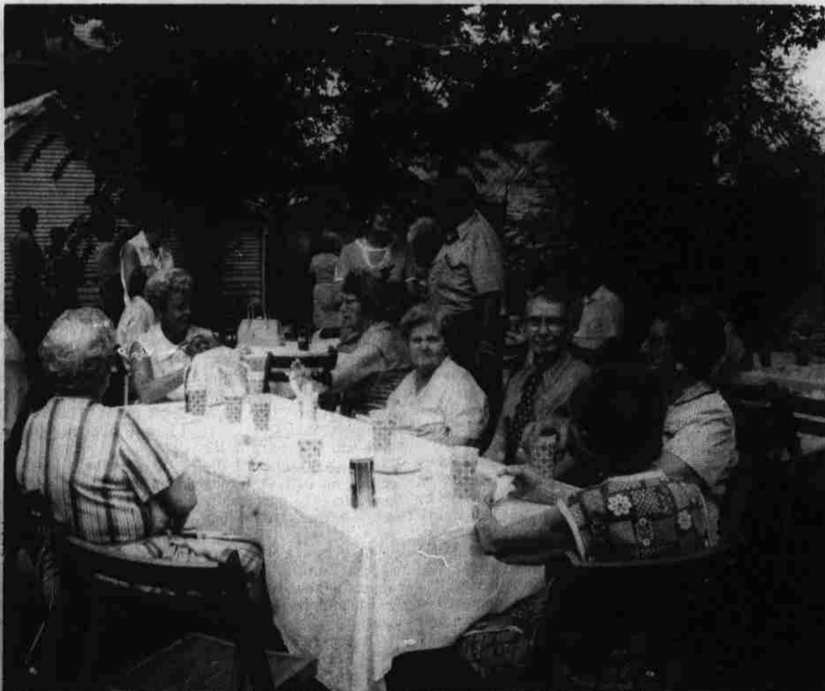
They are all "sixty plus" and all enjoy it.