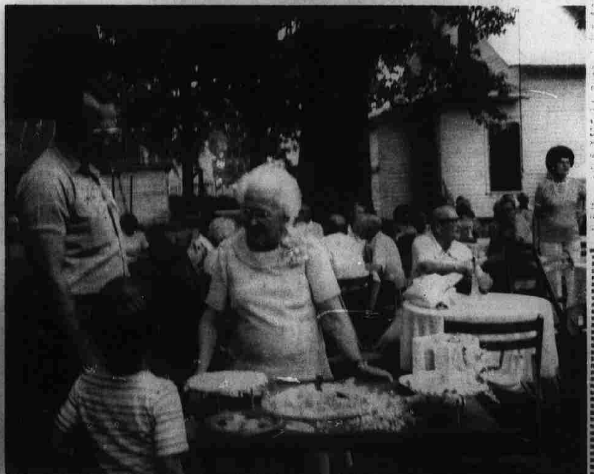
They ate the whole thing.