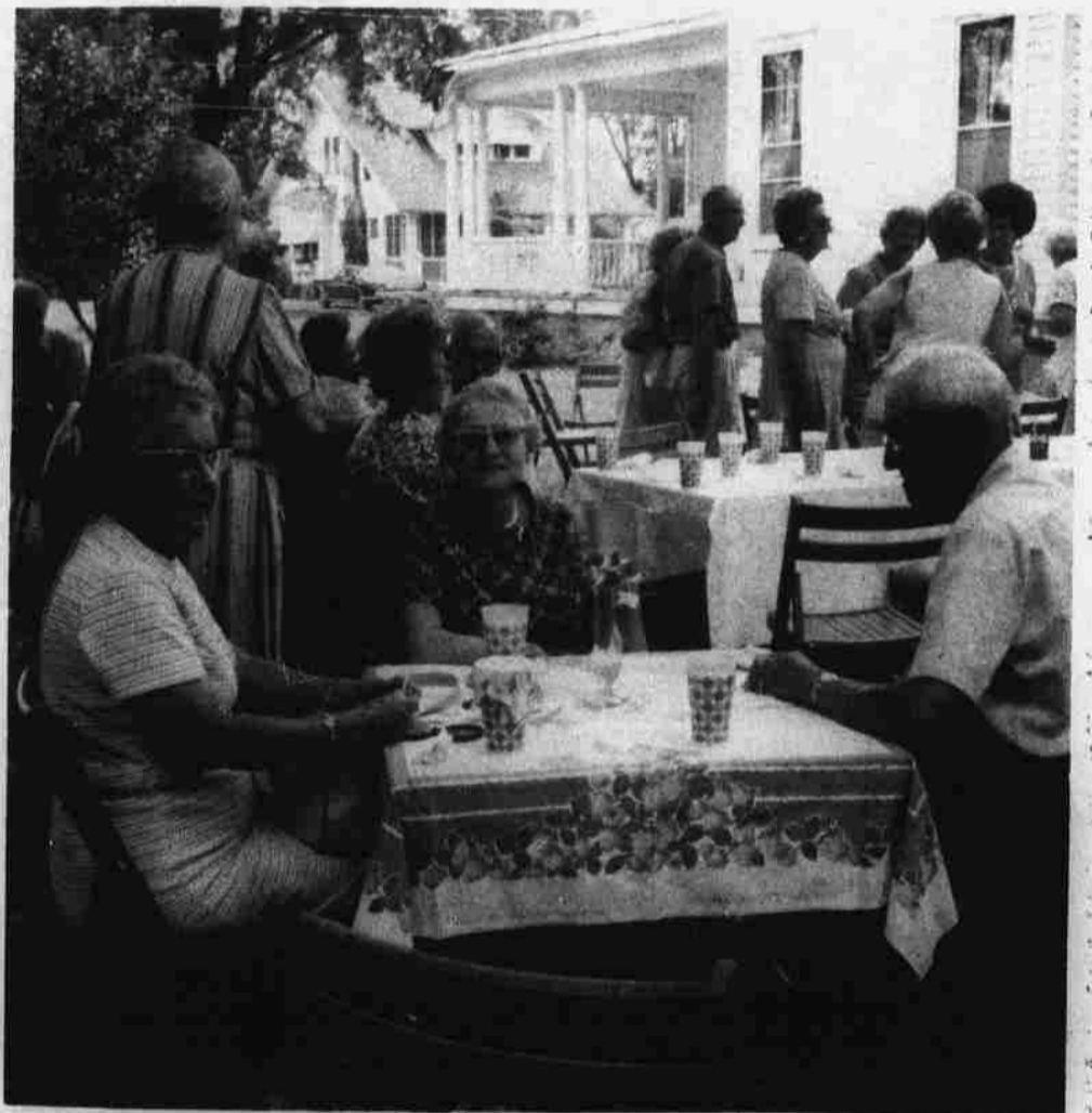
Members of the group discuss the club's activities as well as beautiful Hertford.