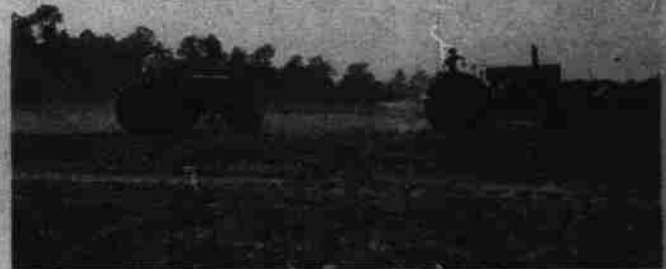
Perquimans farm family, father and son, get the good earth ready