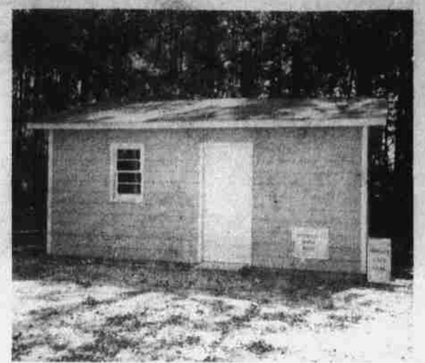
This Is The County Dog Pound Located Off Grubb Street Extended

Local area high school students are being encouraged to enter the 1973 Pfeiffer College prose and poetry competition now underway.