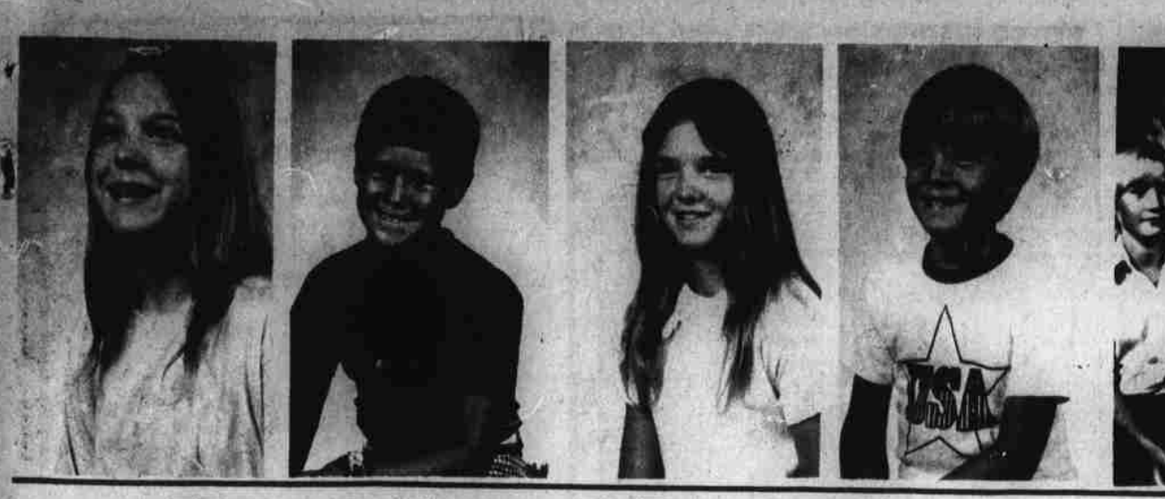
The Perquimans Weekly, Hertford, N.C., Thursday, February 14, 1974-Page 7