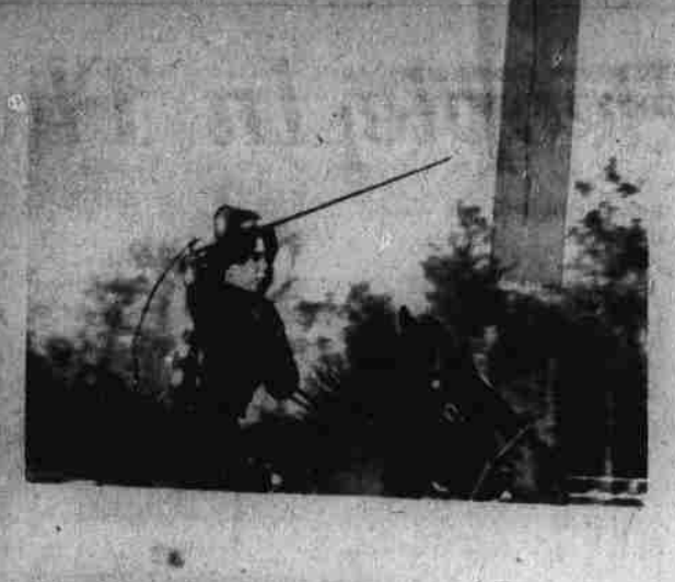
LOTS OF ACTION-This horse and his rider whiz around the ring displaying their accuracy and speed. The site was the Horse and Pony Club Show held Sunday.