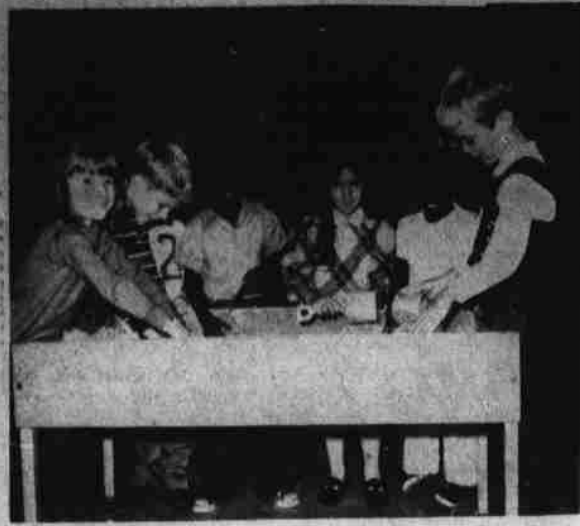
PLAYFUL LEARNING — These kindergarten students at Hertford Grammar School enjoy playing in the classroom sandbox. Although the activity is fun, it is also an expressive outlet, teaches the children how to get along with others, and is a form of exercise.