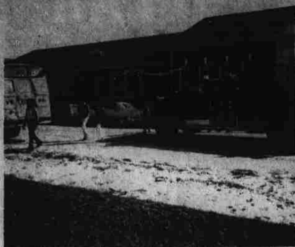
FIRE DRILL —During Fire Prevention Week, the Winfall Volunteer Fire Department held fire drills Tuesday morning at Central Grammar School and Union School. In the pictures above, students at the grammar school