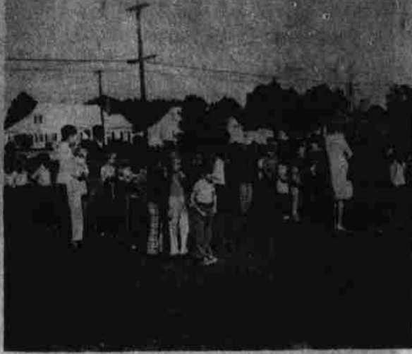
quickly move onto the lawn and patiently wait there. It took the students and teachers one minute to evacuate the building.