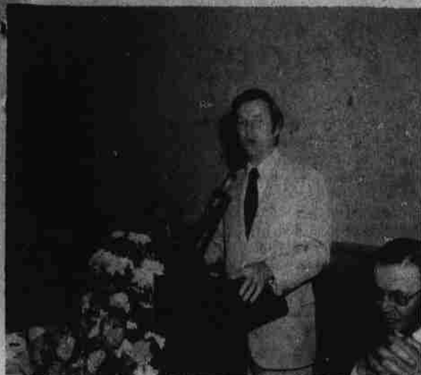
SUPERVISORS MEET —Lt. Gov. Jim Hunt spoke to the more than 450, who were in attendance at the Area V.N.C. Association of Soil and Water Supervisors Meeting, Tuesday Night.