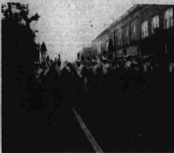
WINNING BAND — Placing first in the Christmas Parade band competition was Elizabeth City State University. Second place went to the Perquimans county Marching Unit. Northeastern High School Band also participated but withdrew from competition.