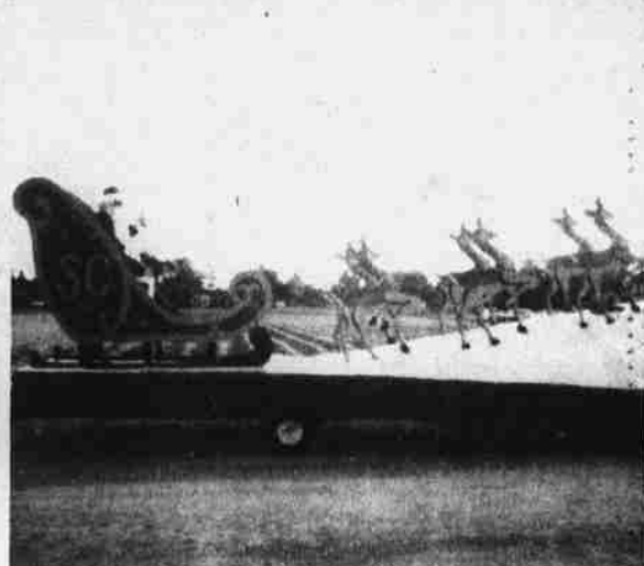
ON HIS WAY — The highlight of the parade was the visit from Santa Claus. Shown here, St. Nick prepares for his trip from Perquimans High School to awaiting children in downtown Hertford.