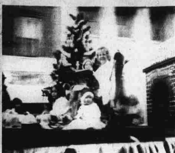
SECOND PLACE FLOAT — This float with the theme, "Christmas Is Family Togetherness" was entered by the Perquimans County Jayettes and placed second in float competition. First place went to the Elizabeth City Junior High School float.