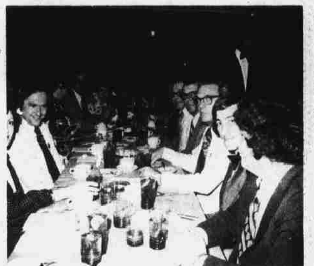
HOMETOWN FOLKS — Over 40 residents of Perquimans County ventured to Raleigh to see the hometown native receive the Will Wynne Award. The group chartered a bus.