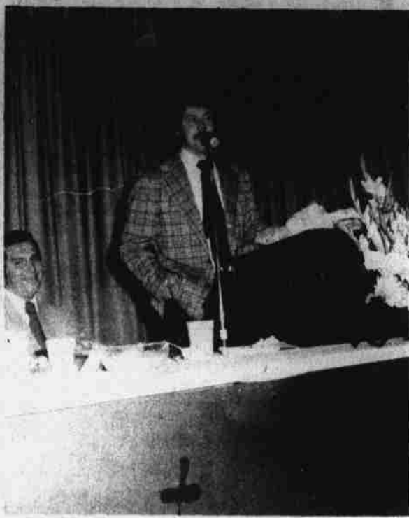
FAVORITE SON — Jim "Catfish" Hunter, the county's favorite son, was also on hand at the awards night banquet to speak. He pointed out to the group some of his reasons for signing with the New York Yankees.