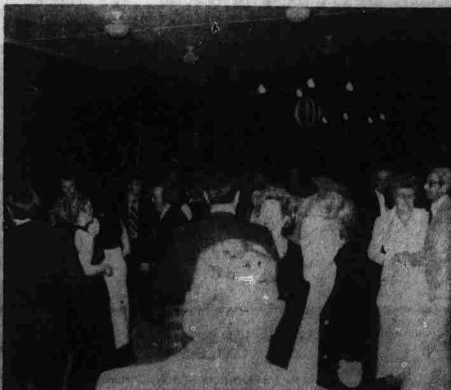
THEY COULD HAVE DANCED ALL NIGHT — The eighty some couples attending the Jaycettes' Cupid's Fling showed no hesitation when the music began. A good time was had by the young and the young at heart.

Good Food, Fine Music, & Excellent Company