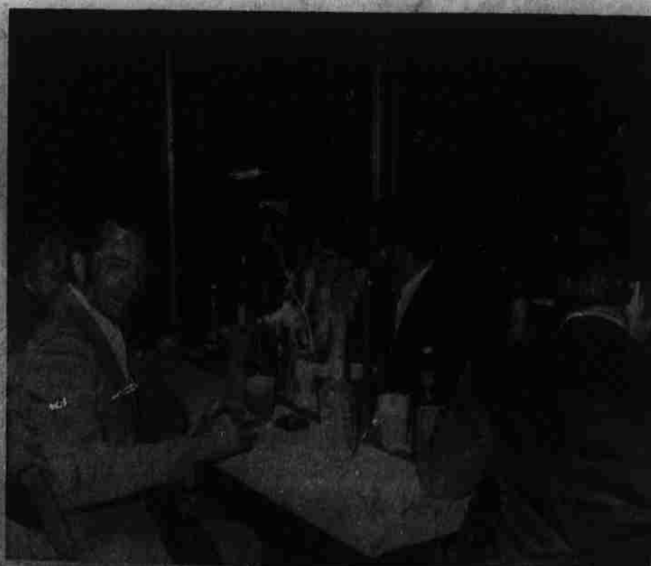
EVERYBODY HAD A GOOD TIME — Good food, fine music, and excellent company were just a few of the many elements which combined to make the first annual Valentine's Dance a successful event. Those who attended are already waiting for next year.