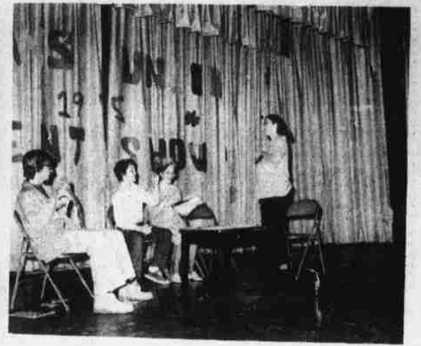
IN THE TEACHERS' LOUNGE — While waiting for the final decision from the judges of the talent show, these members of the Perquimans Union Student Council presented a skit entitled, "The Teacher's Lounge". The students good naturedly mocked several of the faculty members.