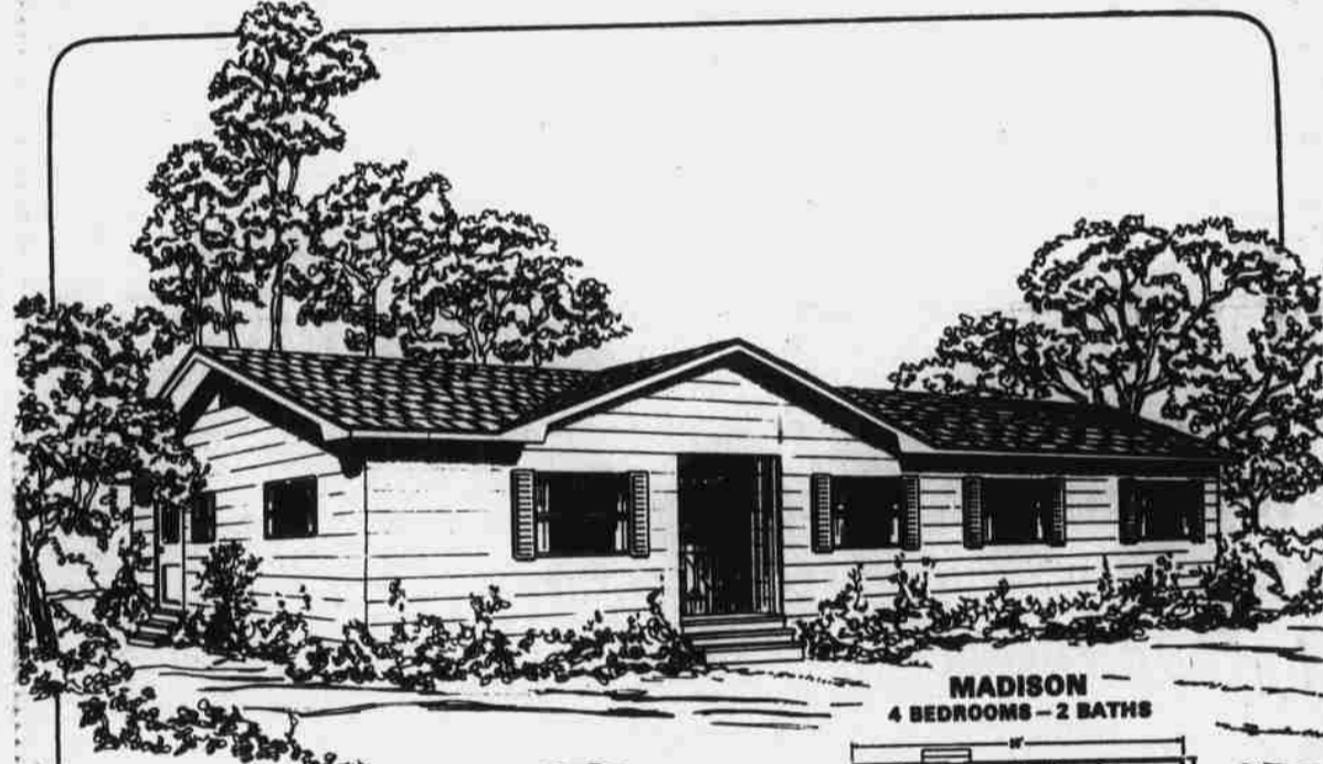
MADISON 4 BEDROOMS — 2 BATHS