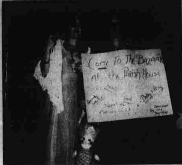
Here prepare to go out and advertise some of the used clothing for sale.