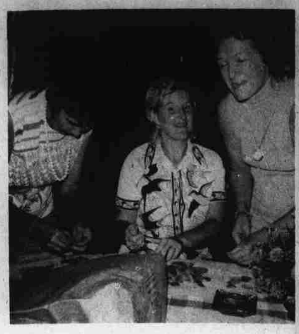
Club members hard at work