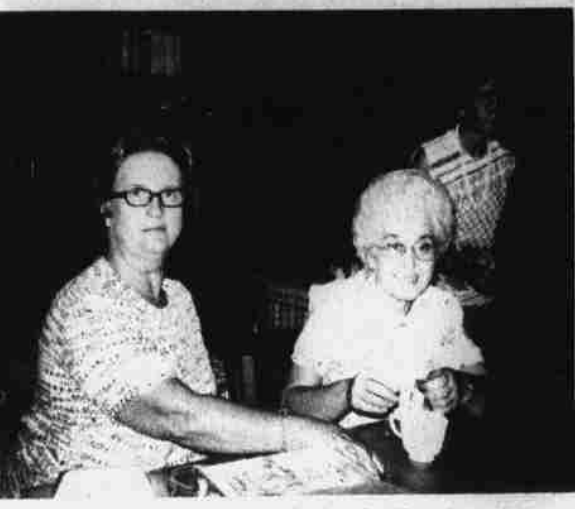
Collecting the proceeds for the fire dept.