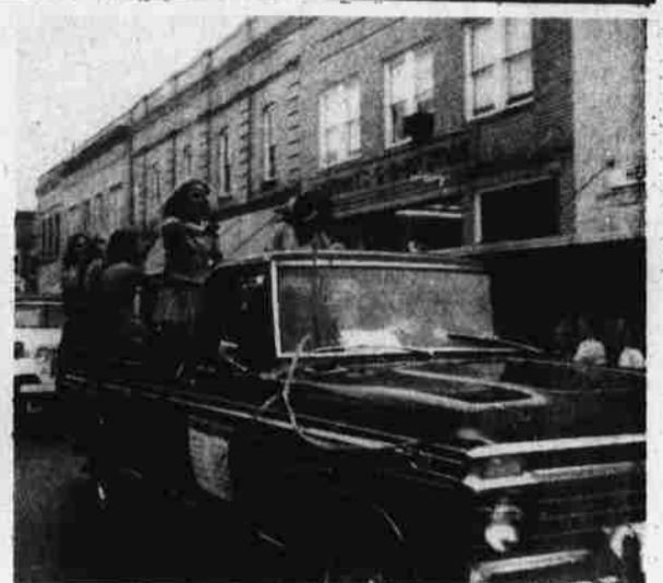
homecoming queen and princess nominees and floats by other school and community organizations.