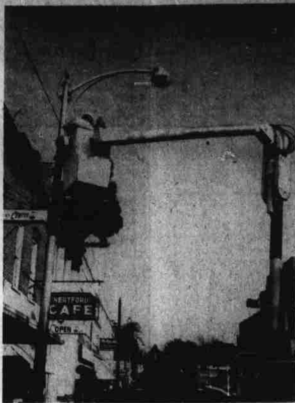
IT'S BEGINNING TO LOOK A LOT LIKE CHRISTMAS — Town employes recently began putting up the Christmas decorations along Hertford's major streets in preparation for the upcoming Holiday Season. The Christmas lights will be turned on during tomorrow's Christmas Parade and the arrival of Santa.

The holly is the special flower of December. It is used all over the world in this celebration. The turquoise is the December gem.