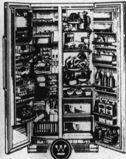
Model RS 194