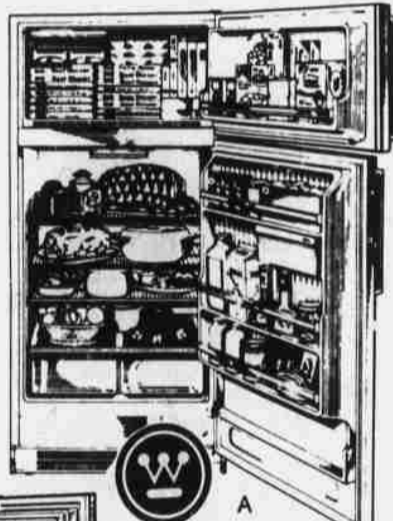
Model RT 194

There's a new name for quality in home appliances. On March 1, 1975, Westinghouse major appliances became one of the White Consolidated Industries, and a new name was introduced in quality appliances for the home. White-Westinghouse. A name that combines up-to-date performance engineering with a tradition of product dependability. White-Westinghouse Major Appliances, the new name for quality in major appliances. One of the White Consolidated Industries.