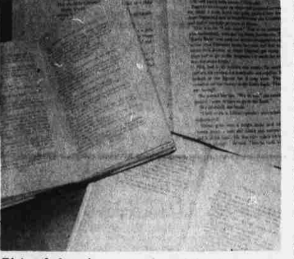
Pictured above is a comparison of the size print in three different types of books available in the Perquimans County Library.

THE BUILDING OF JALNA MORNING AT JALNA MARY WAKEFIELD YOUNG RENNY WHITEOAK HERITAGE Above is a sample of the actual size of these large print books