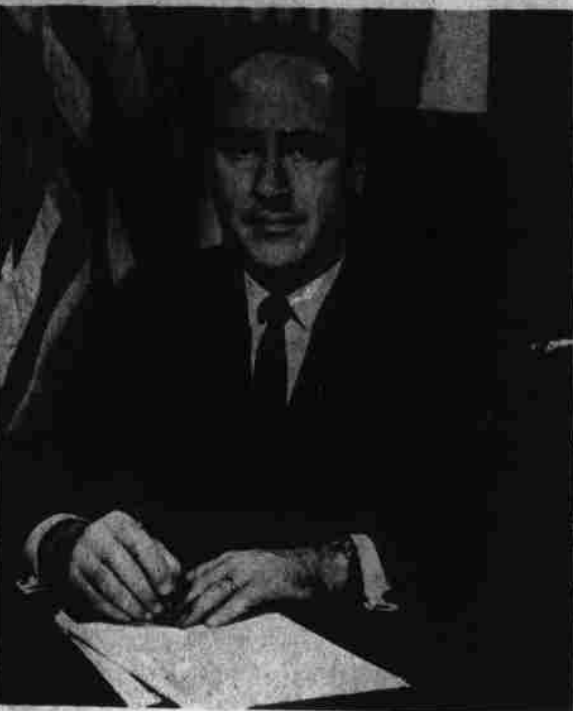
FORMER GOV. BOB SCOTT