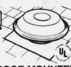
ROOF-MOUNTED POWER VENTILATOR

Hot summer heat build-up in the attic penetrates downward into the living area causing discomfort for the occupants — additional wear and tear on air conditioners. Power ventilators help add to the life of shingles, rafters, insulation roof and outside paint... Besides helping you