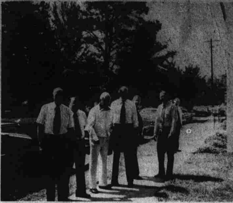
LOOKING IT OVER — Shown above, members of the Perquimans County Board of Commissioners look over the areas located on both sides of the recent annex to the Perquimans County Courthouse. During their Monday meeting, the commissioners discussed the possibility of placing parking lots in these areas to be used by those having business in the courthouse and to ease the parking problem on Front St.