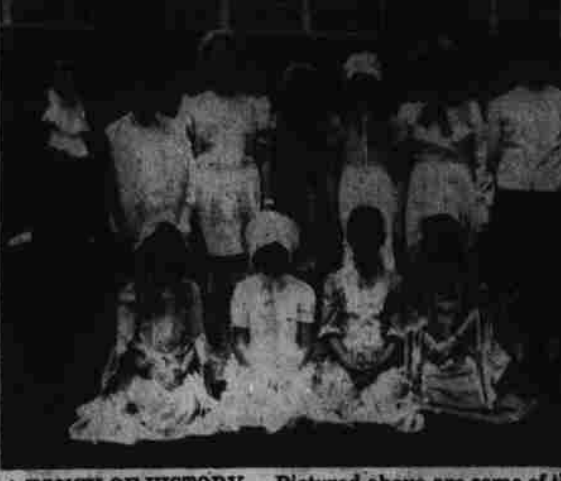
A TOUCH OF HISTORY - Pictured above are some of the fifth and sixth grade students who participated in the costume contest on Friday.

RECITATION CONTEST - Union School students ticipate in the recitation contest, one of the many activities held in connection with Happy Birthday Week at Union School