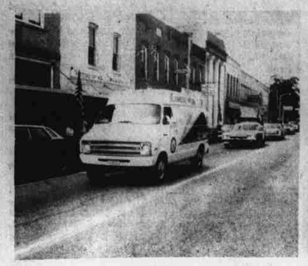
Page 10-The Perquimans Weekly, Hertford, N.C., Thursday, June 17, 1976 Flag Day Celebration