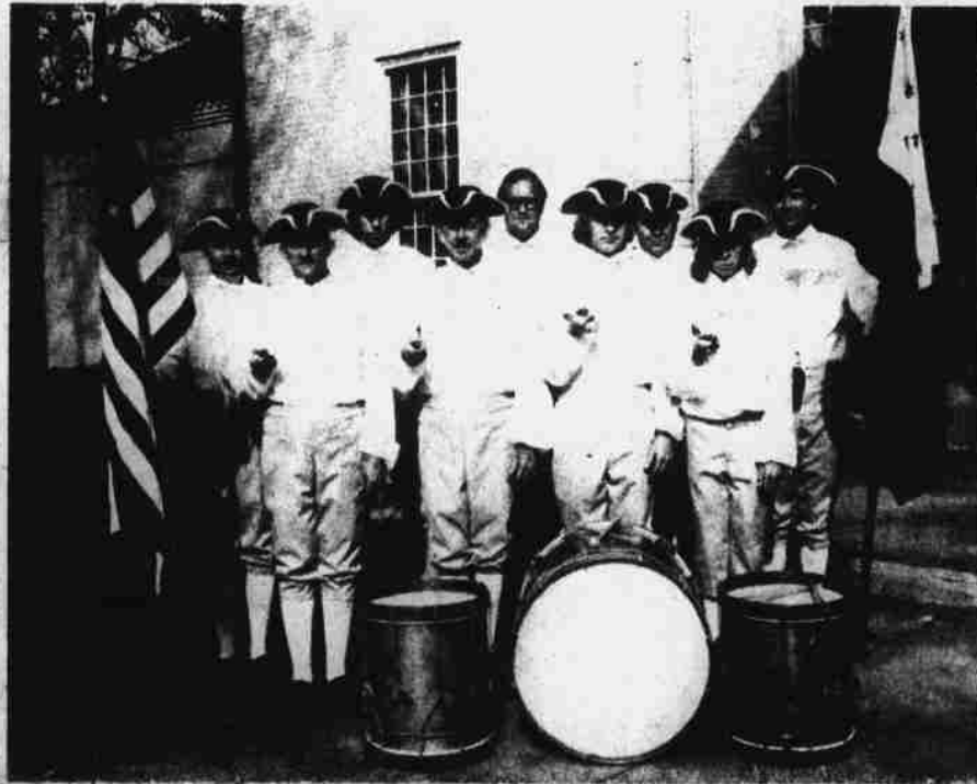
FIFES — DRUMS — The well known Hertford Fifes and Drums will be among those featured during the weekend celebration. The group will present their popular flag pageant on the courthouse green Sunday, July 4 at 7 p.m.