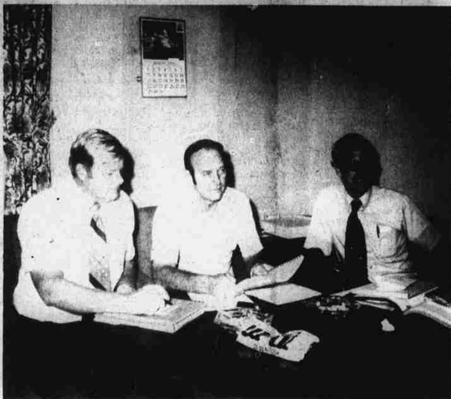
CONTRACT AWARDED — At the Monday morning meeting of the Perquimans County Board of Commissioners, the awarding of a contract for the digging of three deep wells in Perquimans County was the main order of business. Listening to the discussion are (left to right)