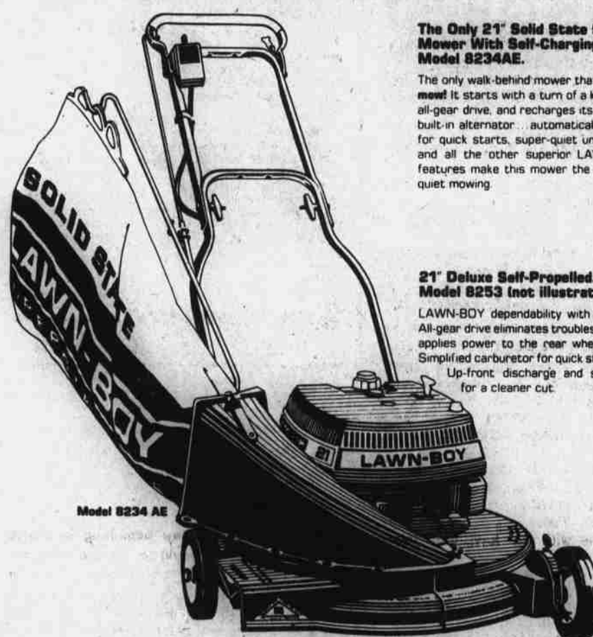
The Only 21" Solid State Self-Propelled Mower With Self-Charging Electric Start. Model 8234AE.

The only walk-behind mower that recharges while you mow! It starts with a turn of a key, propels itself with all-gear drive, and recharges its ni-cad battery with a built-in alternator... automatically. Solid state ignition for quick starts, super-quiet under-the-deck muffler, and all the other superior LAWN-BOY engineering features make this mower the ultimate in quick and quiet mowing.