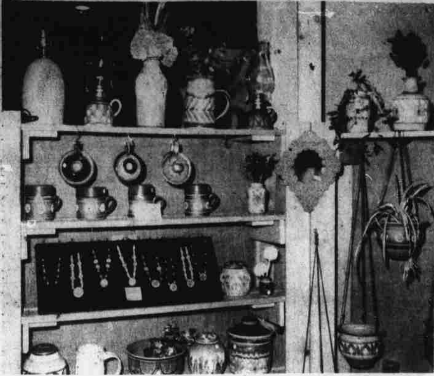
ALBEMARLE CRAFTSMAN'S FAIR — This booth featuring pottery, including hanging baskets and jewelry, was just one of the many featured at the 18th annual Albemarle Craftsman's Fair held

Friday, Oct. 8 Smoked Sausage Potatoes-Cheese String Beans Biscuit Milk