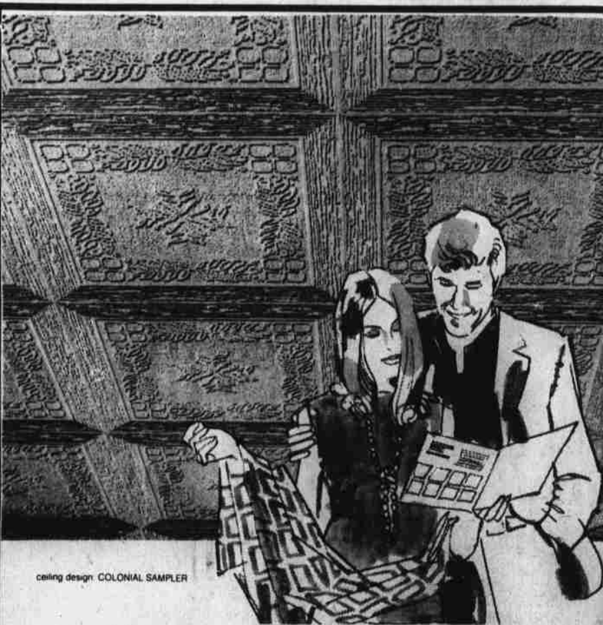
ceiling design: COLONIAL SAMPLER

DAVENPORT INSULATION, INCORPORATED Ahoskie, N.C.