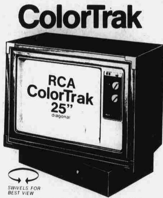
ColorTrak RCA ColorTrak TV in a swivel-based Contemporary console