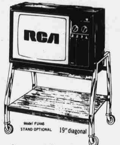
A great buy! Superb RCA XL-100 Color TV at a terrific price!

Remember... if it isn't RCA, it isn't XL-100.