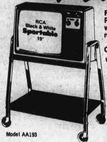
Family-size RCA Sportable TV with its own rollabout stand Only $189 WITH TRADE

LET'S SAY HE WEIGHS IN AT 200 POUNDS; RIGHT OFF, HE'S WORTH $30 ON CONSOLES, $20 ON PORTABLES, AND $14 ON B & W SEE? EVEN THE GLUE FACTORY WOULDN'T GIVE THAT MUCH! AND WE EVEN GIVE HIM BACK TO YOU INTACT. SORRY. (WE ALREADY HAVE ENOUGH $30 PEOPLE) OFFER ENDS SATURDAY