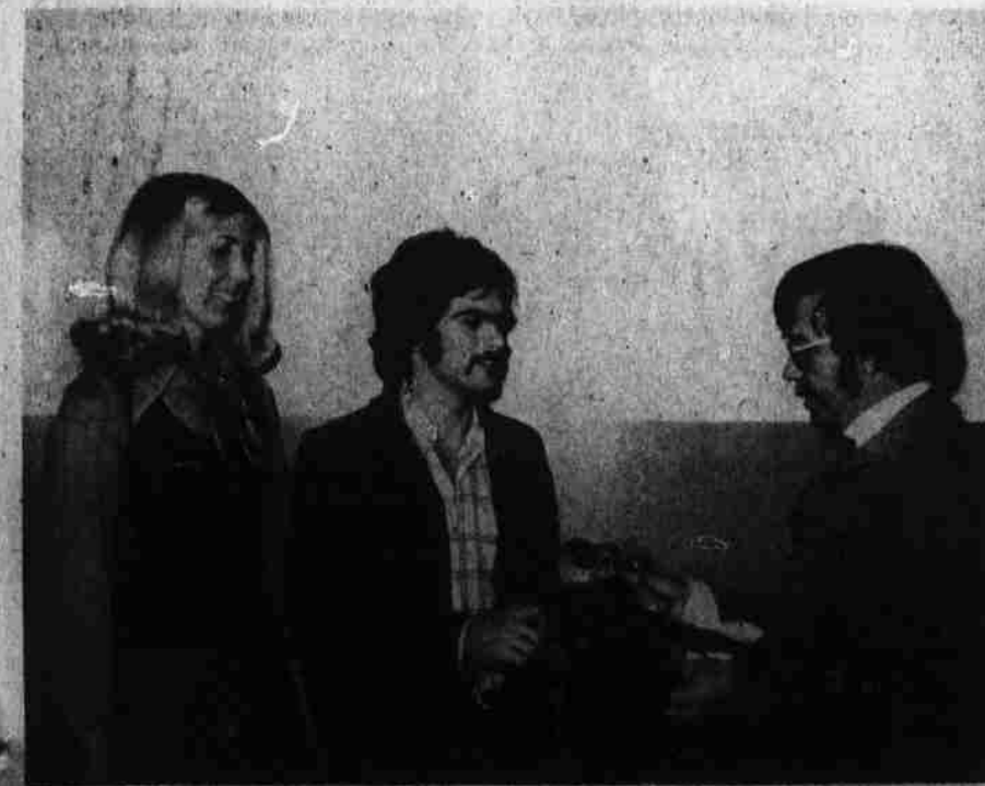
CAMERA FOR JOURNALISM CLASS — Members of the Perquimans High School Journalism class, publishers of "Proximity," recently received an unexpected Christmas present in the form of a new Polaroid camera with case. The camera was a gift from The Perquimans Weekly to the staff for their