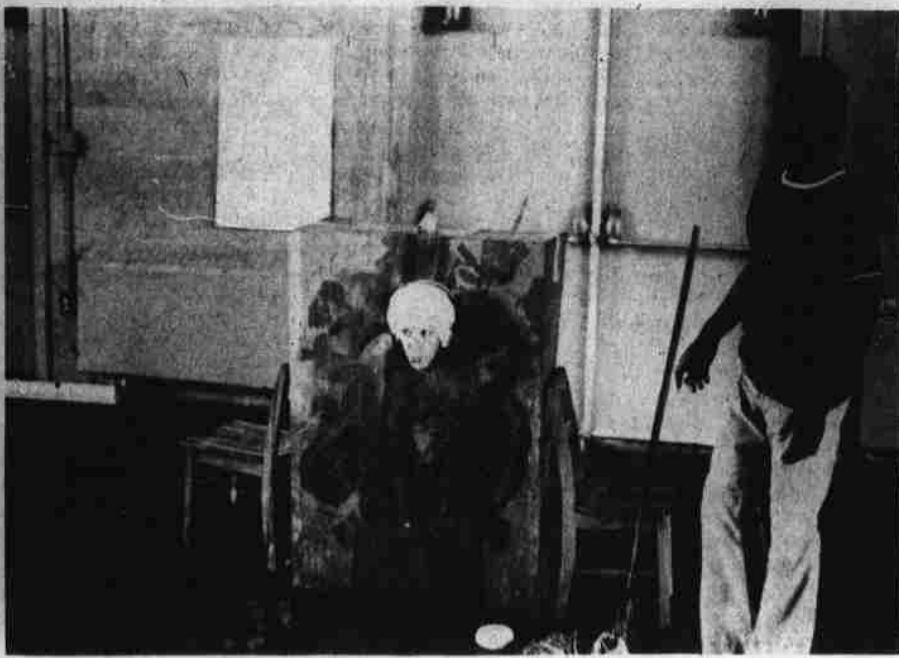
REVENGE — Union School students as teachers good-naturedly posed as a sponge target during Saturday's fundraising games.