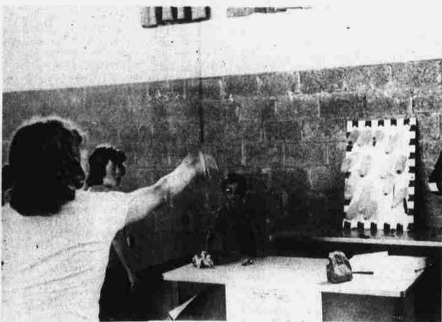
PERFECT AIM — One festival participant sized up her target and then took careful aim at the dart throwing booth.