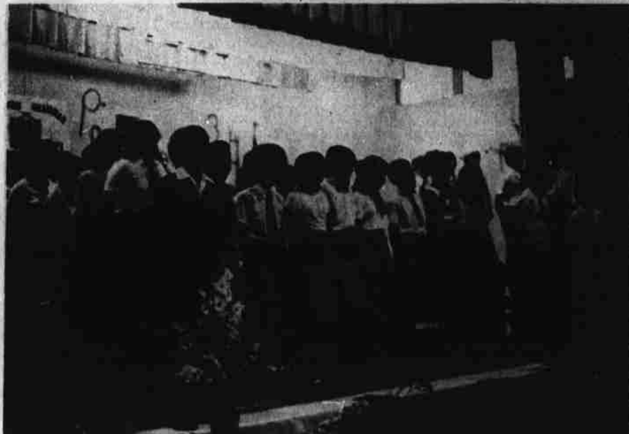
"IT'S MUSIC" — To the delight of parents, teachers, friends and others, the sixth grade students at Hertford Grammar School presented "It's Music" on June 2. The musical, com-