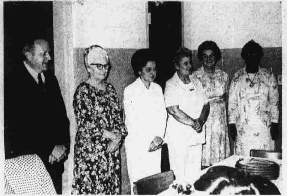
RETIRING — Six people retiring from the Perquimans County School system were recognized for their many years of service during the Annual Appreciation Luncheon held Friday. Pictured above

The Incredible Dr. Matrix is a compilation of mathematical games columns from Scientific American magazine which explore numerology and coincidence in things like the Kennedy and Lincoln assassinations (Kennedy was riding in a Lincoln made by the Ford company) and the malicious computer HAL in the movie 2001 whose name is a one letter shift from IBM, etc.