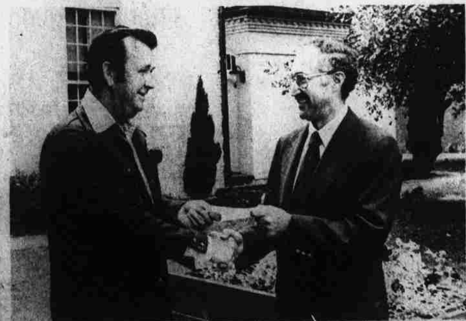
BENEFIT SHOW RESULTS — A $1,000 donation has been made to the Children's Hospital of the King's Daughters in Norfolk, Va., following the benefit horse show sponsored recently by the Perquimans County Horse and Poay Club. Pictured above, club president

For more information, contact the local Farm Bureau office or any of the officers listed above.