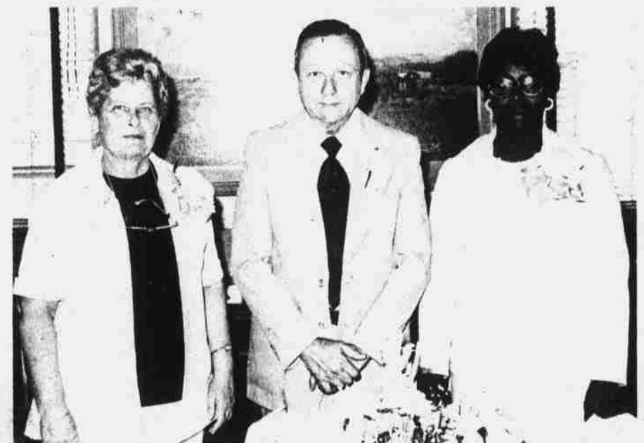
HONORED — Recently honored at a retirement dinner at Perquimans Central Grammar School were three members of the school faculty who are