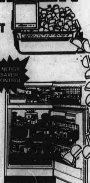
Freezer on the top