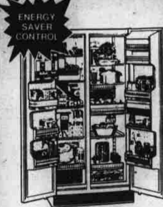
Freezer on the side