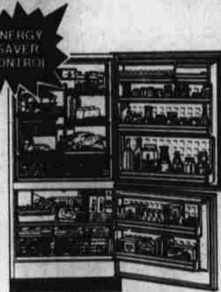
Freezer on the bottom