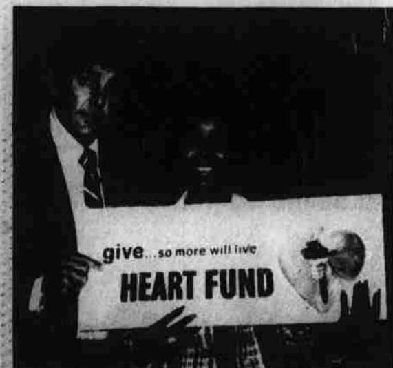
TV PRIVATE EYE MIKE CONNORS, MANNIX, is as concerned about fighting the nation's number one killer—heart disease—as he is about fighting crime on TV. Connors and his Gal Friday (Gail Fisher) urge Americans to give generously to their Heart Fund. Both are celebrity Heart Fund volunteers. Connors served as 1971 Honorary Heart Sunday Chairman for the Los Angeles area.