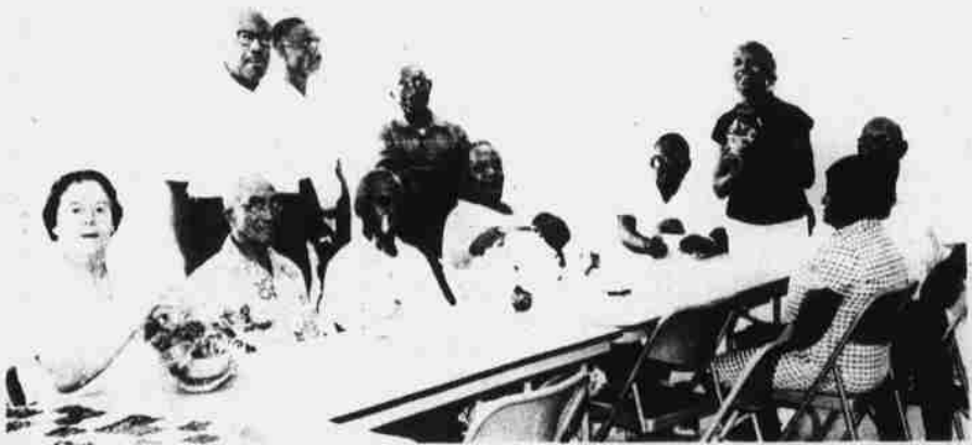
ARTS & CRAFTS — In addition to providing nutritious meals for participants, the Nutrition Program also provides fellowship and activities such as the assembling of arts and crafts materials which participants show above.