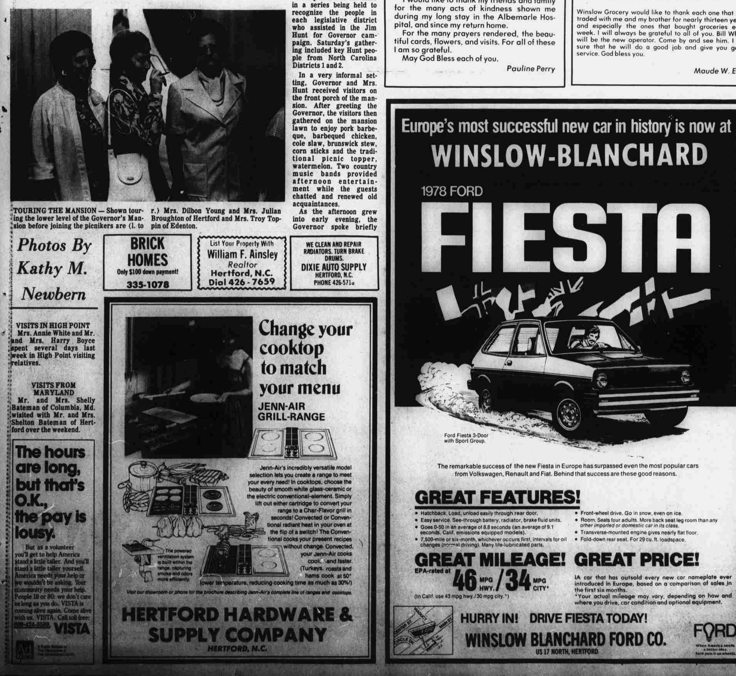
LOCAL FACES - Among the Perquimans a former representative from the First