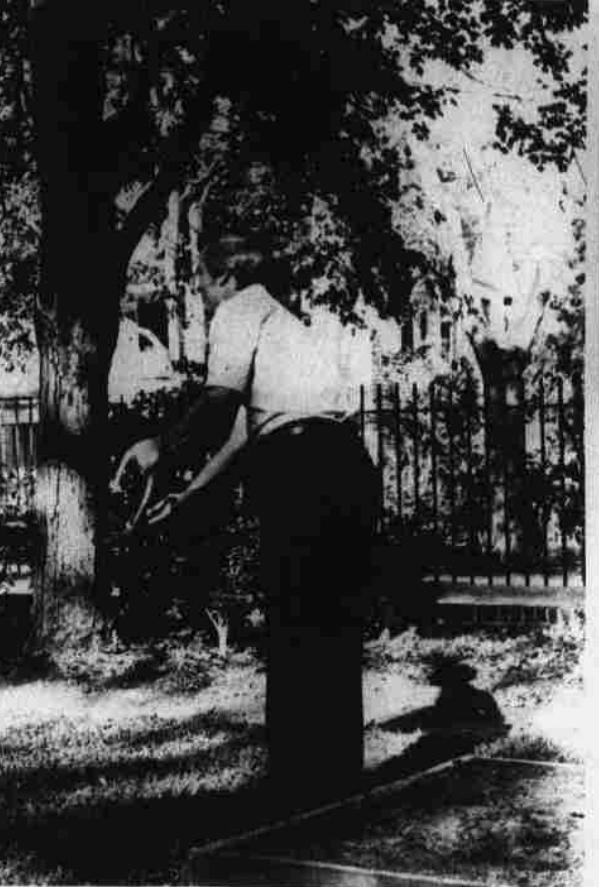
FRIENDLY GAME - Governor Hunt is the picture of concentration as he hopes for a ringer in a friendly game of horseshoes.