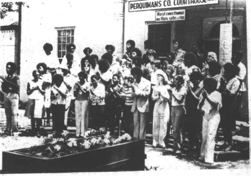
YOUNG VOICES — Providing special entertainment for the week was a presentation on Friday by members of the Per-

courthouse green Friday sponsored by the Belvidere Extension Homemakers Club.