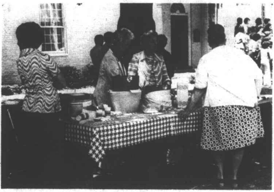
A SPECIAL TREAT — Also held in conjunction with the special week's activities was a homemade ice cream sale on the

various activities of the week was this display of arts & crafts items on the courthouse green.