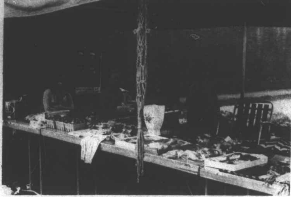
ARTS & CRAFTS — Last Friday marked the climax of Extension Homemakers Week in Perquimans County. Among the

various activities of the week was this display of arts & crafts items on the courthouse green.