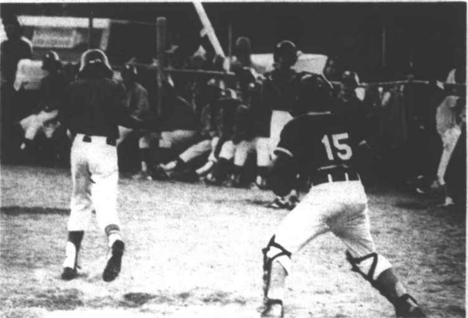
TOURNAMENT ACTION — Following weekend play in Manteo, the Albemarle Babe Ruth All-Star Team of 13-year olds returned home with the District 28 Championship title. Not to be outdone, the 14-15 age group team from the local area also returned home the victors in their bracket.